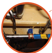
HYDRAULIC SYSTEM CONNECTIONS