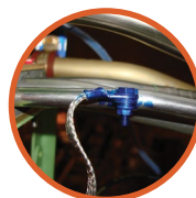
AIRFRAME/STAIR CONNECTIONS, PASSENGER ENTRY DOORS