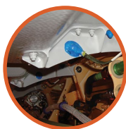
ELECTRIC GROUNDING CONNECTIONS, PLUMBING & GALLEYS

PROVEN & TRUSTED BY MASS TRANSIT & DEFENSE INDUSTRY LEADERS