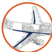
FLOOR FRAMING, PLATE/ BOLT CONNECTIONS